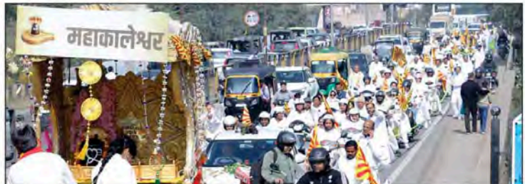
Hisar (HR): A 12 Jyotirlingam Shobha Yatra was organised by the Brahma Kumaris on the occasion of Mahashivratri.