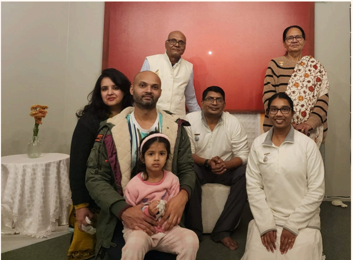
Group photo after world meditation hour

On the third Sunday, we had visitors from a BK family at HRC. They stayed at Baba Retreat Centre for the weekend and enjoyed the beautiful surroundings. We all gathered in Baba's room for world meditation hour and Amrit Vela followed by Murli class the next morning.