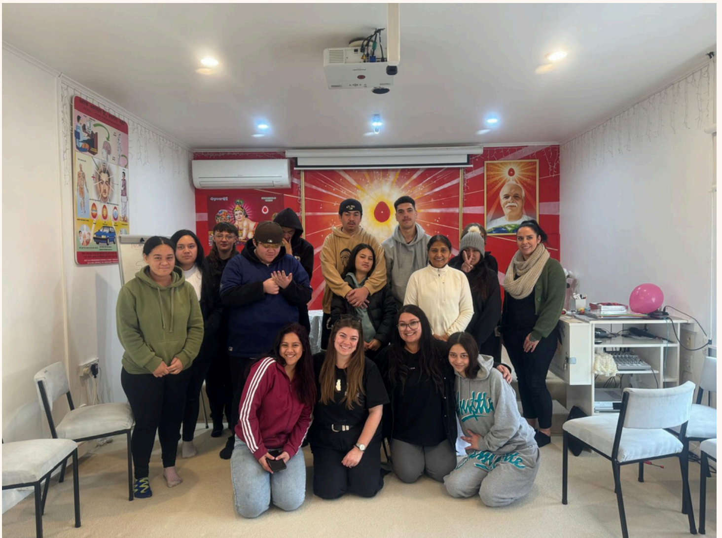
Group photo with the attendees

On Friday 7th June, Sister Bhavana conducted a youth program at wellington centre. There was a very good turn out from the youth in the community and they all really enjoyed the spiritual insights.